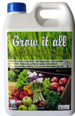
2.5 Litre Jerry Can