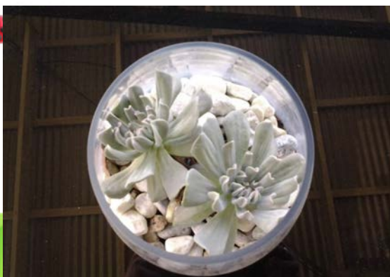
After 4 weeks