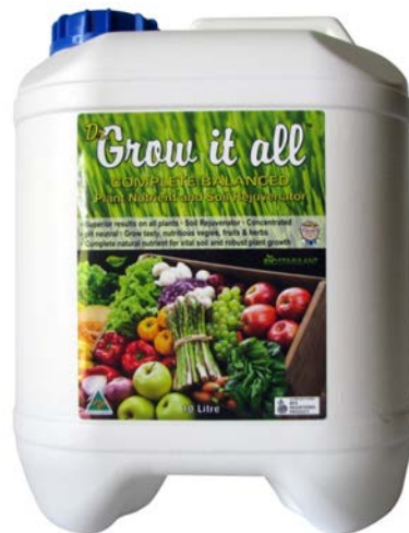
20 Litre Drum