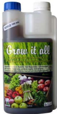
1 Litre Measure Bottle

Dr Grow It All is currently packaged in the following sizes and distributed through various independent retail outlets: