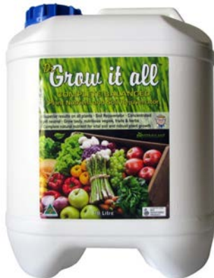
10 Litre Drum