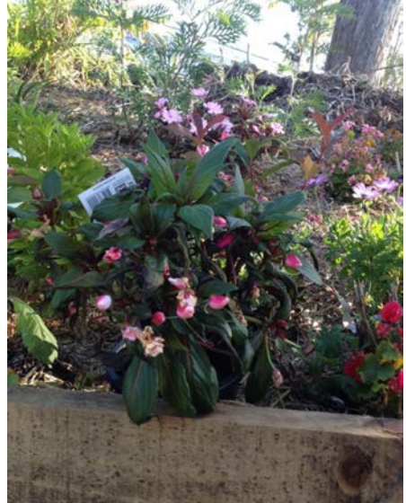
After 12 Hours