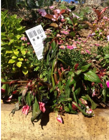
Before application of Dr Grow It All