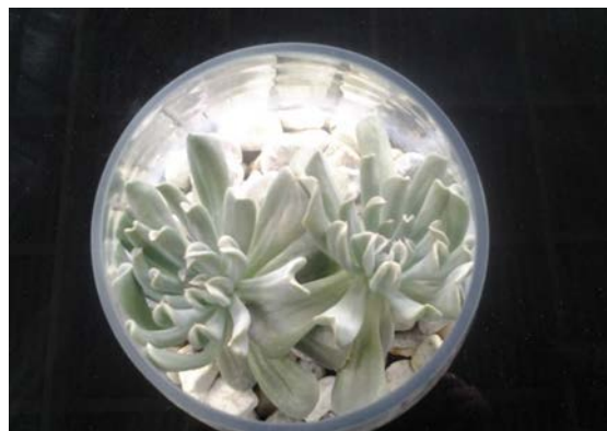
After 6 weeks