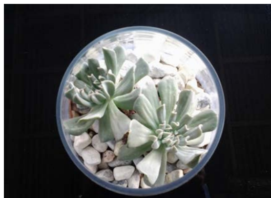
After 2 weeks