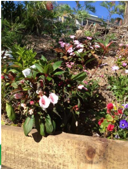
The next day