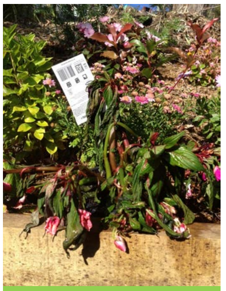
Before application of Dr Grow It All