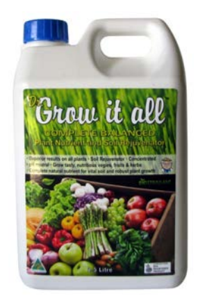
2.5 Litre Jerry Can