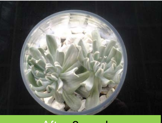
After 6 weeks