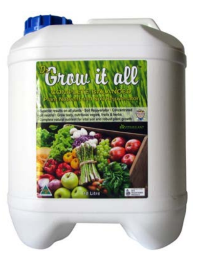
20 Litre Drum