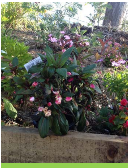
After 12 Hours